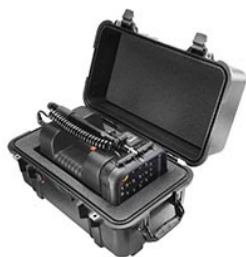
1460AALG 1460 Case with custom fit foam